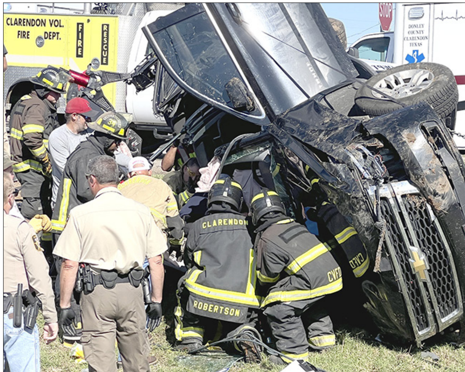
Emergency personnel work to rescue a Hutto, Texas, woman from the wreckage of her family car last week after the vehicle veered off the road entering Clarendon. The family of six escaped serious injury in the accident.