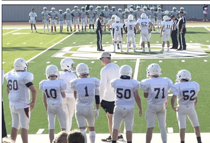
The Junior High Colts beat Shamrock this past week 20-18. The Colts showed heart and grit with their team consisting of 11 boys going against a team of 23.