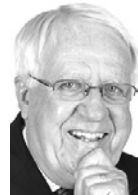
the idle american by don newbury